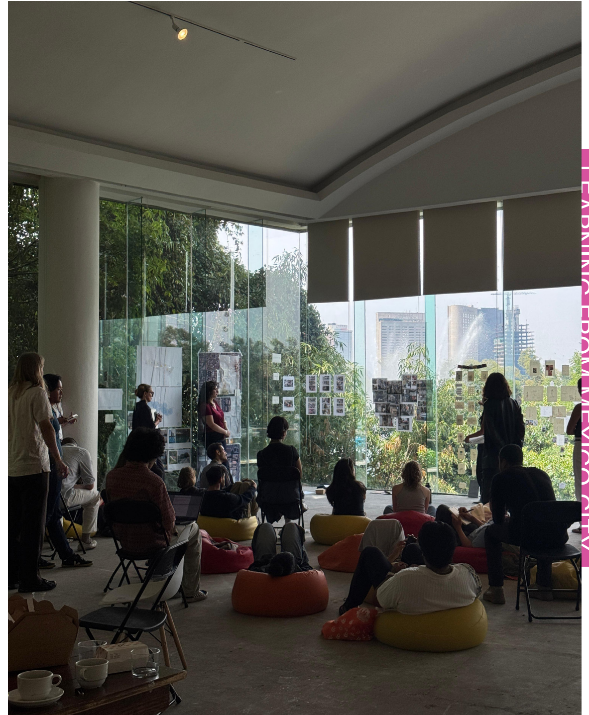
Image of a group pinup session during the AA summer School in LatAm, Lago Algo, 2025

Internal transportation within Mexico City is included.