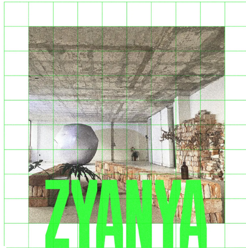
Image of Zyanya as presented during ARCO NORTE, a project bringing together cultural spaces in the north of Mexico City and those operating beyond the hegemony of the city's centralised cultural districts. Curated by PROYECTOR, 2024